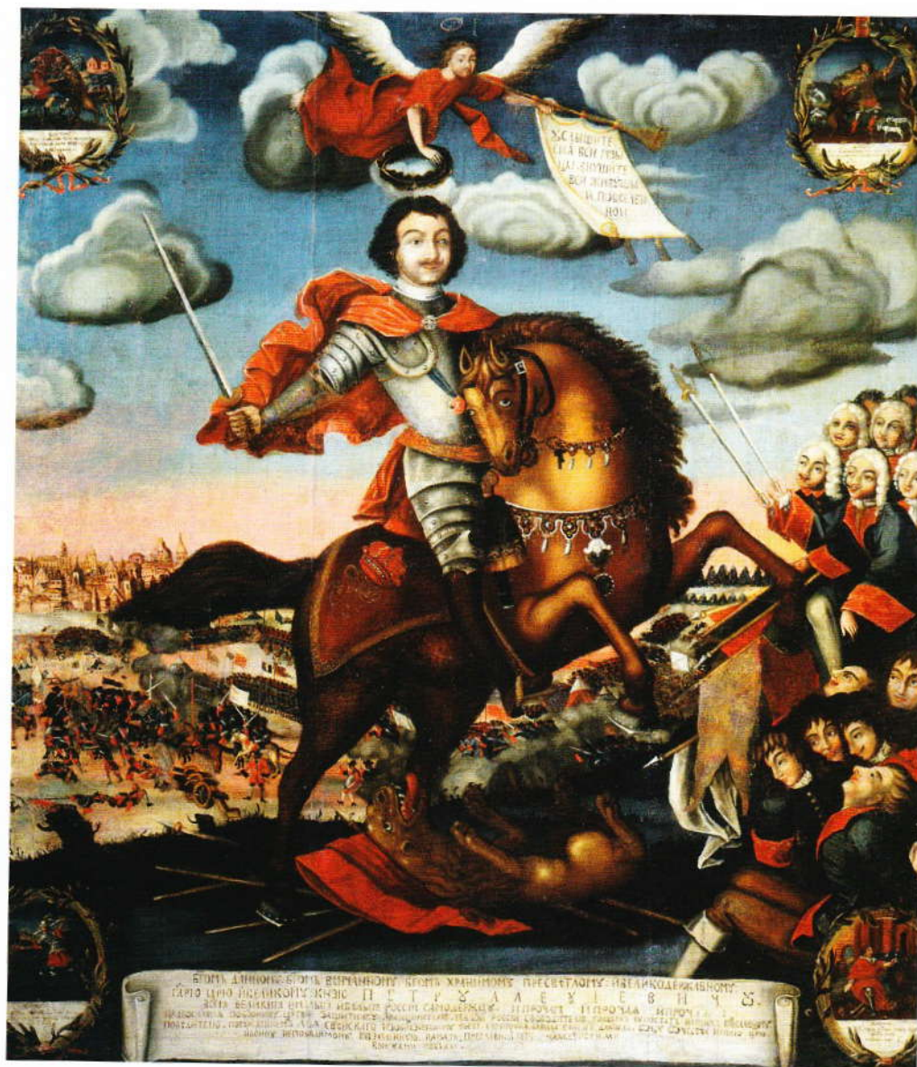
Left 'The Apotheosis' of Tsar Peter I of Russia, the Great, the victor at Poltava, painted by an unknown artist in 1710.