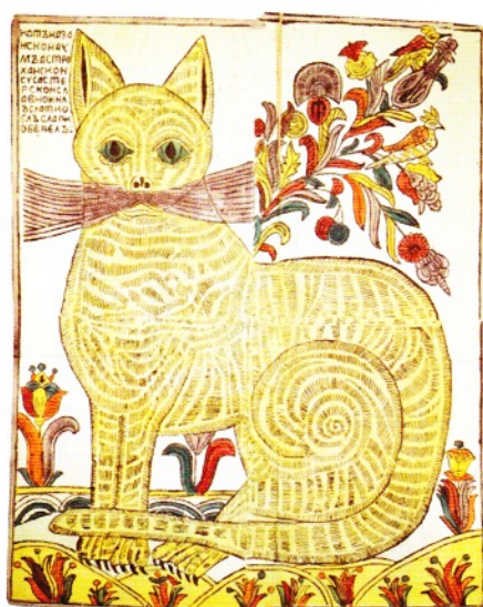
Above Peter I is satirised in this 18th-century Russian woodcut known as 'the Cat of Kazan'.

Charles now had no option but to retreat. This was the moment Peter had been waiting for. Now he would give the Swedish king his open battle but on his own terms. He threw down the camp walls and emerged with 30,000 troops who were still fresh. They formed up in battle line, infantry in the centre, cavalry on the wings, artillery to the rear firing over their heads. It was now mid-morn-