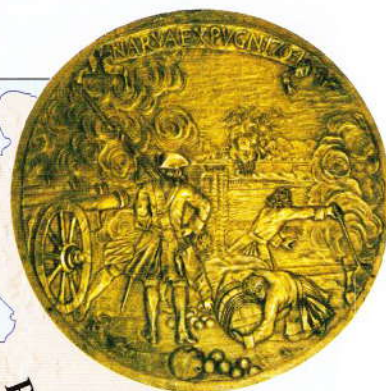
Above The capture of Narva in 1700 by Charles XII's army depicted on a bronze bas relief c.1720 designed by Bartolomeo Carlo Rastrelli.