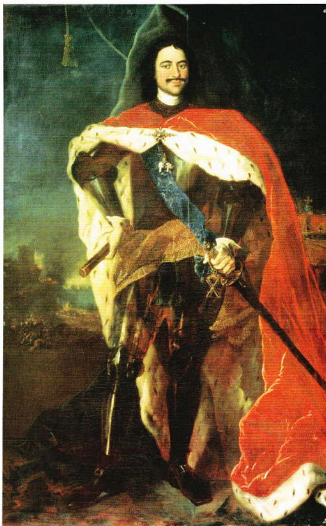
Above Peter the Great (1672-1725) painted by Louis Caravaque (1684-1754).

Peter's first objective was to bring his army across the river. To divert the enemy he sent a detachment of cavalry to make a feint across the Vorskla south of Poltava. Charles rode out from his camp to see what the enemy was up to. There then occurred one of those chance minor events that sometimes decide the fate of nations. A musketball struck the king in the left foot and opened up a long gash which immediately began to bleed profusely. He refused to have it tended and only when he was on the point of toppling from his horse was he carried half-conscious to the surgeon's station. It was June 17th, Charles's 27th birthday; it was not a good omen.