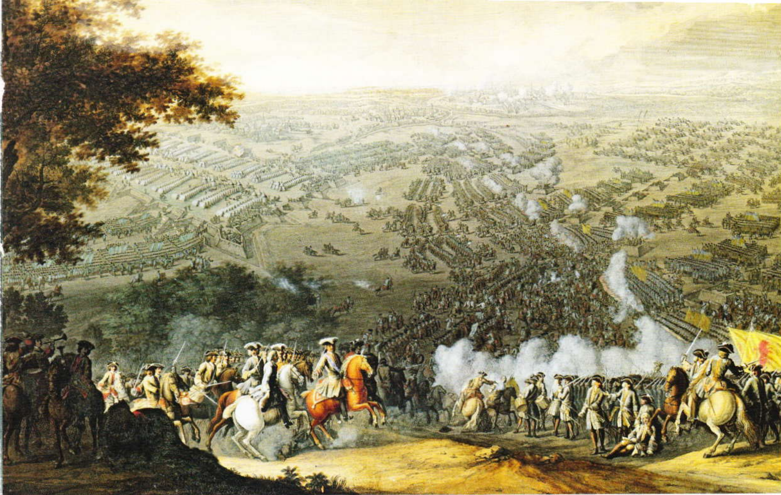
Above A 1709 coloured engraving of The Battle of Poltava by one of the Nicolas Larmessin family after the painting by Pierre-Denis Martin.

and wagons and was unlikely to start out from Riga until the end of July.