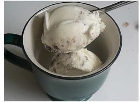
A sample of frozen yogurt.

For all those who are looking for a tasty and cold treat, go on down to Lemonberry on the Medina Square. It’s delicious and you’ll be glad you went!