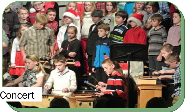
5th Grade Concert