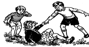
Strategies taken from: schoolcounselor.com and ohio.schoolcounselor.org