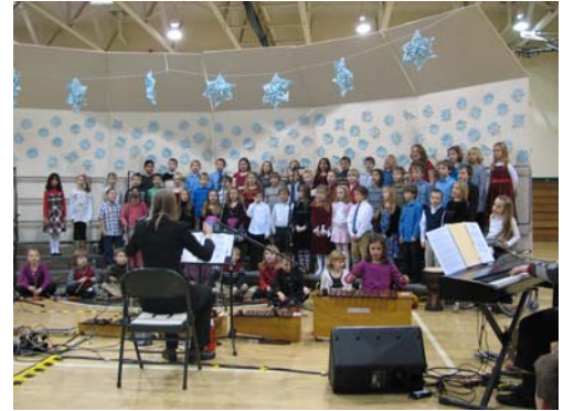
2nd Grade Christmas Program

Second Grade Grandparents Day Wednesday, June 1, 2011, 2:15 pm Lodi Primary Front Lawn