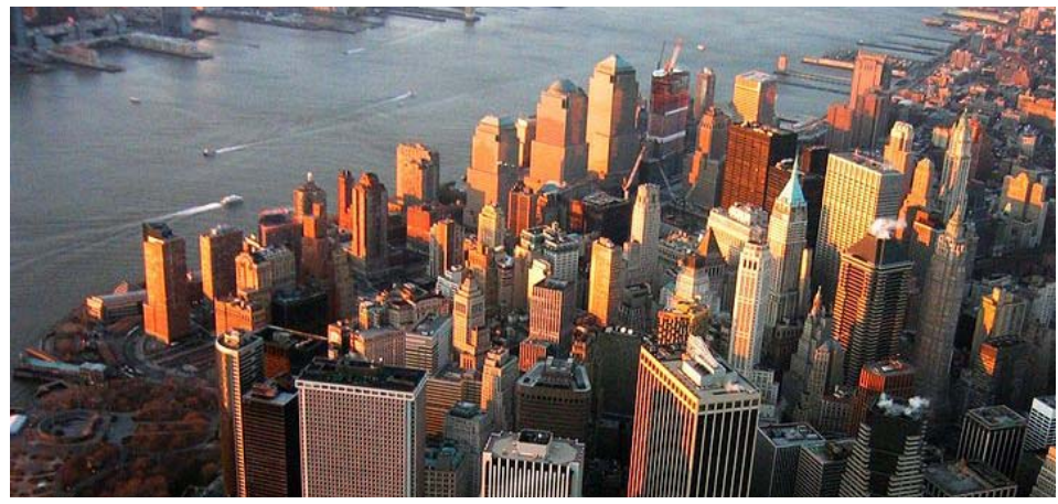
New York City was used as the basis for Unova, the game's central metropolis.

The animations and other small improvements keep the game interesting and addicting, but what