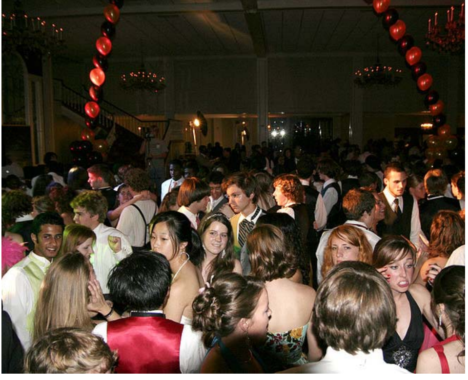
Prom is known for its crowded dance floor and extravagant dress and decoration.

While some think of really cute ways to ask their dates, others are just going as friends and keeping it casual.