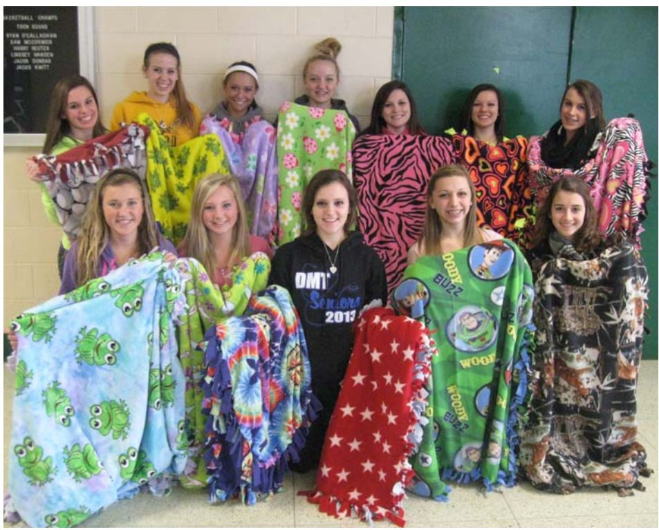
Cheerleaders show off the blankets they made to donate to Project Linus.