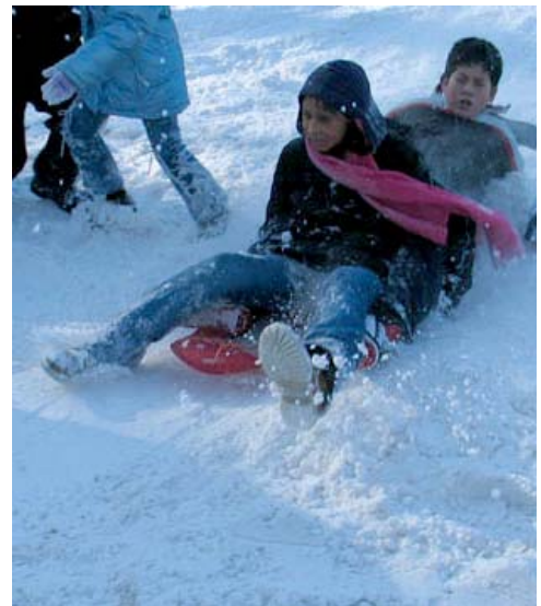
Sledding is a favorite activity of the winter months and holiday break.

Students and staff should all have fun over break, but remember to stay safe!